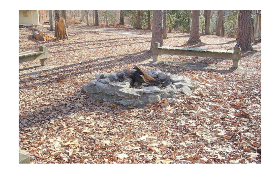
Each unit of cabins has a fire ring located in the center of the circle of cabins.