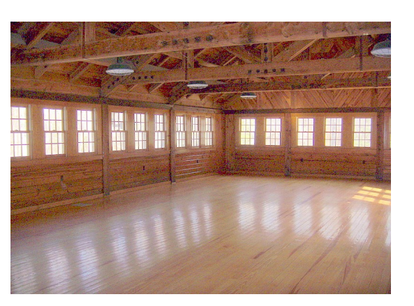
The interior (east end) of Swift Creek Banquet Hall