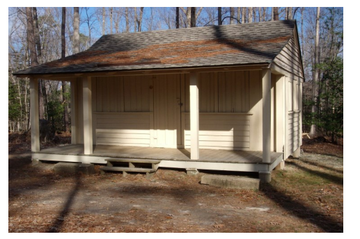
A single cabin (sleeps 4 to 8) that is within a circle, or "unit" of cabins. The circle sleeps 28 total.