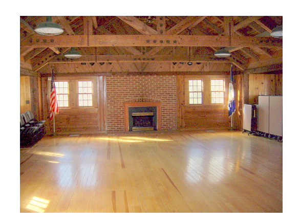
The interior (west end) of Swift Creek Banquet Hall.

The capacity of the Swift Creek Banquet Hall is 150. The capacity of the Powhatan Banquet Hall is 125.