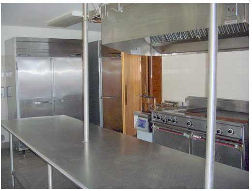
Kitchen – Swift Creek Banquet Hall. Industrial size kitchen appliances are included.