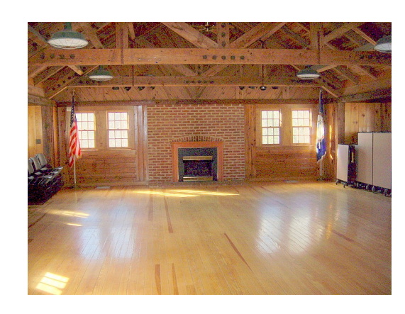
The interior (west end) of Swift Creek Banquet Hall.

The capacity of the Swift Creek Banquet Hall is 150. The capacity of the Powhatan Banquet Hall is 125.