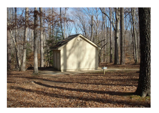
Restroom and Shower Buildings are located within the cabin unit areas.

(overnight use – 4 p.m. to 10 a.m.) Each Unit – Capacity 28 $175 Cabin units are rented at the Park Office or by calling 804-796-4255 (options #5) and can be rented up to eleven months in advance of the first day of the reservation. 2 night minimum stay.