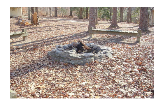
Each unit of cabins has a fire ring located in the center of the circle of cabins.