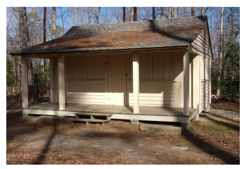
A single cabin (sleeps 4 to 8) that is within a circle, or "unit" of cabins. The circle sleeps 28 total.