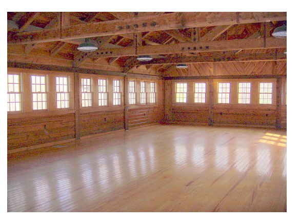
The interior (east end) of Swift Creek Banquet Hall