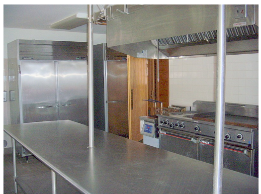
Kitchen – Swift Creek Banquet Hall. Industrial size kitchen appliances are included.