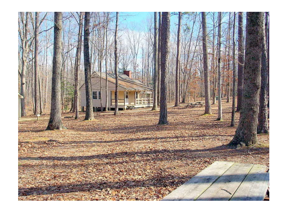
Outdoor Cabin Area – Pictured is the Lodge Building (one provided with each cabin unit).