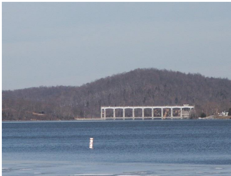
View of Claytor Lake dam from Claytor Lake State Park's boat ramp.

Imagine yourself on a waterbody that is more like a wide river than a lake. When you do, you have a picture of Claytor Lake. Claytor Lake, a 4,363 acre reservoir, stretches northeastward from Allisonia across the Pulaski County countryside for about 21 miles to its dam near Radford. From Claytor Lake State Park, visitors view a sparkling lake, bustling with boating activity, with the top of Claytor Lake dam in the distance. Visitors who want to explore can ride 15 miles upstream to Allisonia, where the New River enters the lake. Claytor Lake is shallow in areas upstream from Lighthouse Bridge, the only bridge that crosses the main lake (Pulaski County Route 672), so be cautious if you roam upstream from the bridge. Near the midpoint of Claytor Lake, the only major tributary, Peak Creek, enters the lake. If you are not familiar with Claytor Lake's key locations, refer to the lake overview map on the last page of this report.