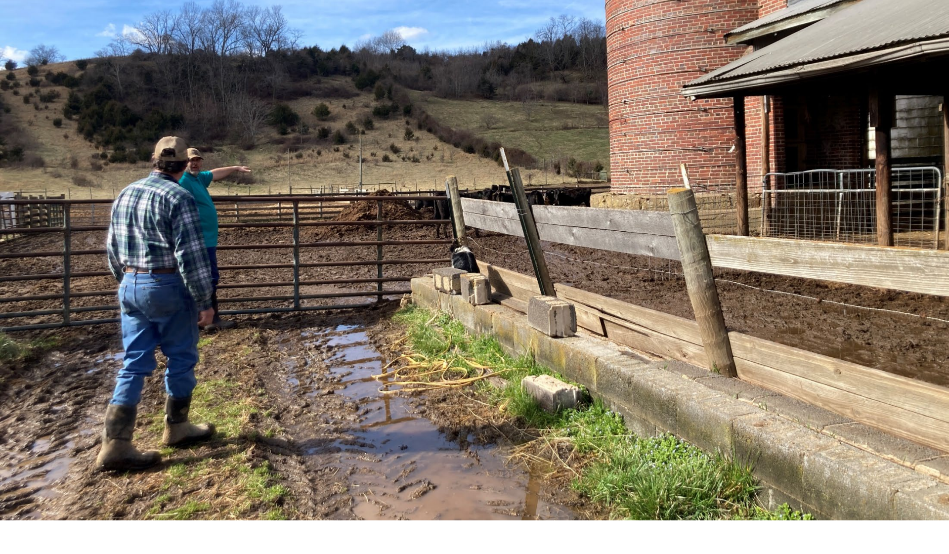
Type of storage (Wastewater and runoff contributions)