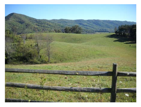
Figure 4C. Mature, stable sinkholes in cohesive soils.