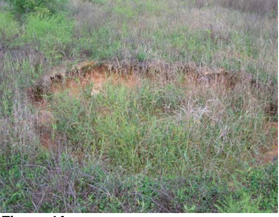
Figure 4A. Actively forming cover collapse sinkhole in granular sediments.

The investigator should be aware of any area where there are signs that water is actively infiltrating into the surface, as this may be an indicator of a subsurface conduit that is soil-filled but receiving drainage (see Figure 6). In this regard, distinct changes in vegetation can be a clue if topographic is slight or absent. These areas should be carefully noted and investigated if they are to be impacted by proposed site development, as they can be the site of sudden and catastrophic subsidence if not managed properly.