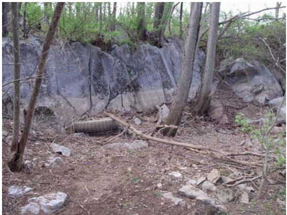
Figure 5A. An estavelle in groundwater low-stand conditions. Note the tell-tale water mark along the rock wall of the structure.

below the opening. This type of structure is sometimes called a "natural trap".