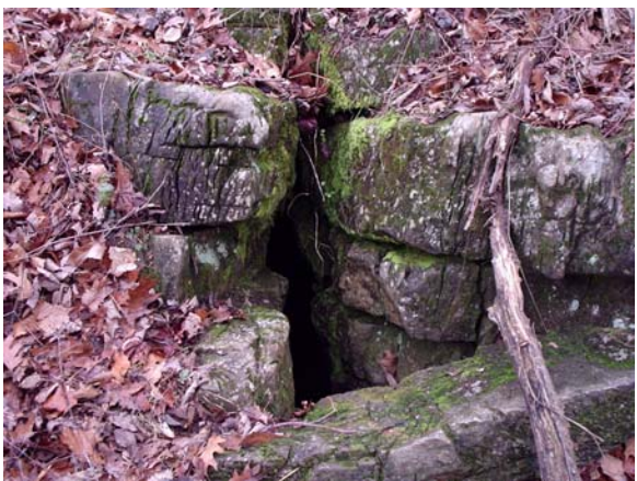
Figure 4D. Mature, rock-walled sinkhole with open "throat" (i.e. cave entrance).