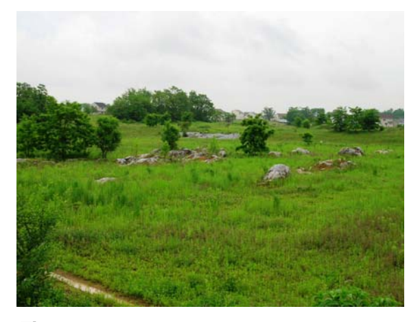
Figure 10. Exposed bedrock pinnacles located in the base of a stormwater detention structure in West Virginia.

Finally, areas of a site designated for storm water management BMPs, especially extended detention and/or retention ponds or impoundments, must be carefully examined for the presence of pinnacled bedrock.