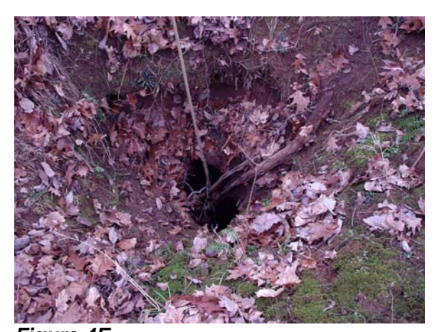
Figure 4E. Soil-bottomed sinkhole with open "throat". A 40' deep vertical cave lies

below the opening. This type of structure is sometimes called a "natural trap".