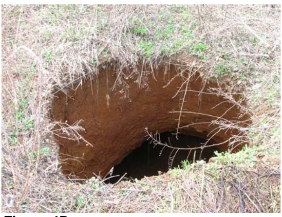
Figure 4B. Actively forming cover collapse sinkhole in cohesive, fine-grained sediments.