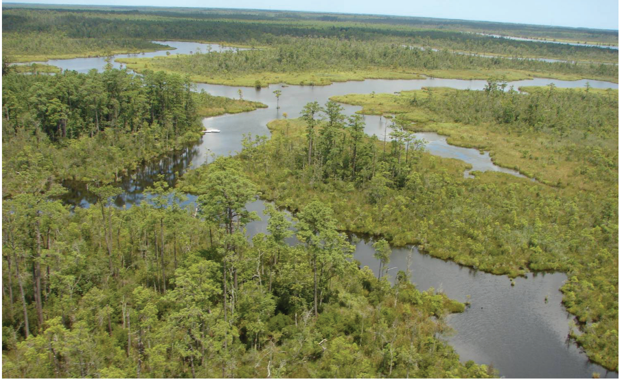
Hand-carry boat launch at North Landing River Natural Area Preserve.