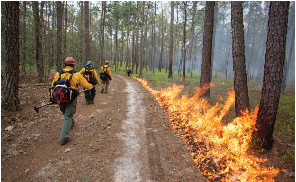
Prescribed burning to restore longleaf pine woodlands and savannas on Southeast Region Natural Area Preserves.