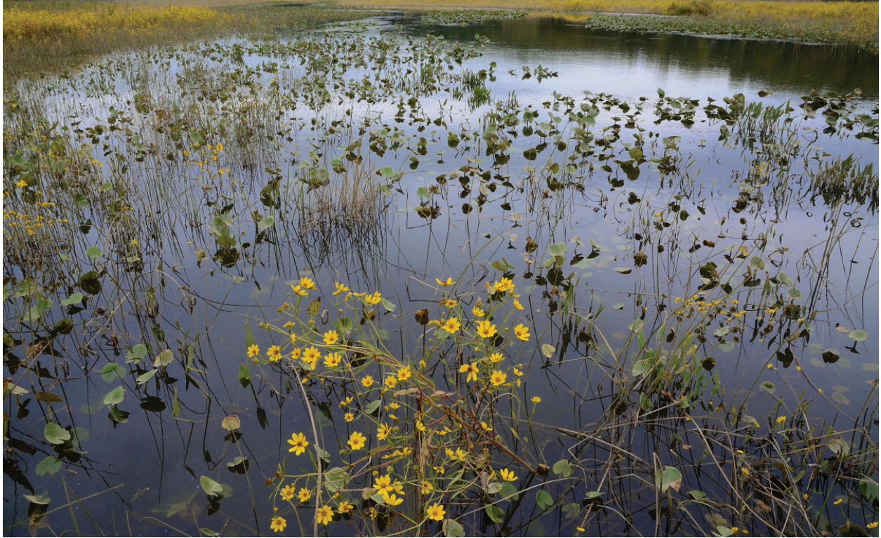
Tidal Freshwater Marsh along Accokeek Creek at Crow's Nest Natural Area Preserve.