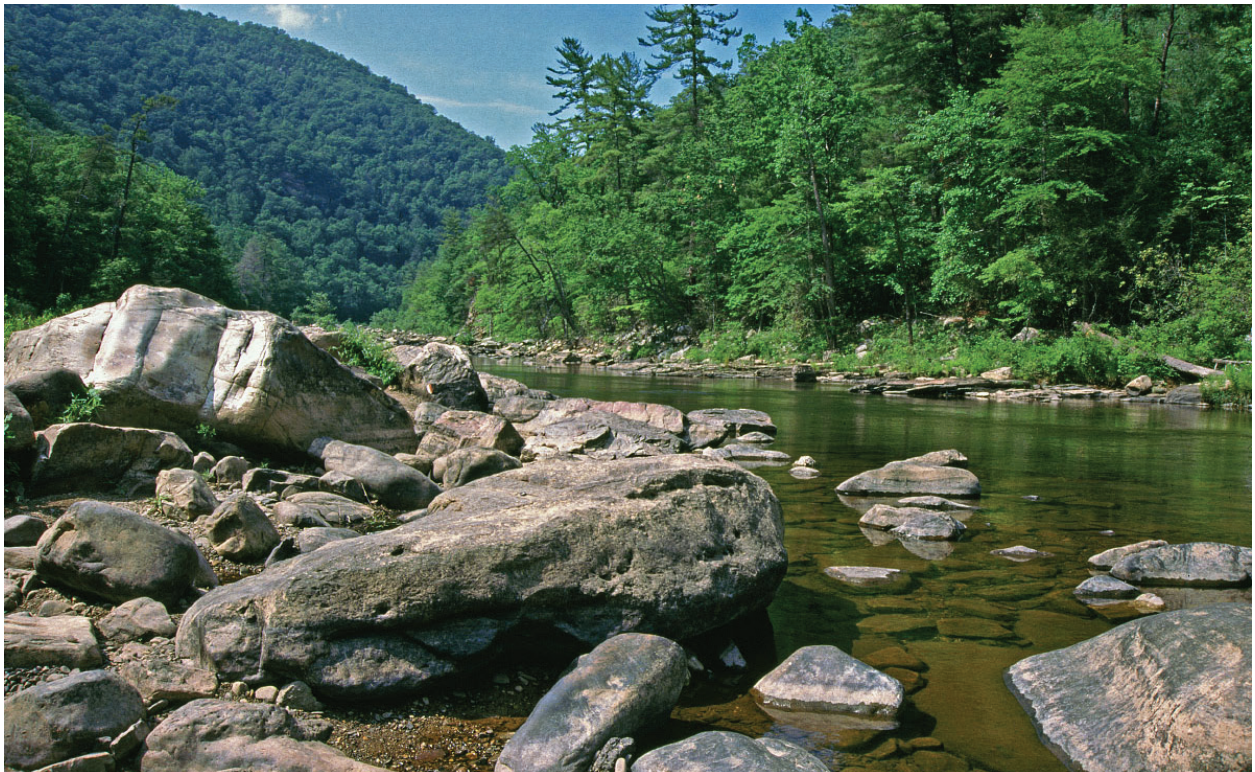
Maury River at Goshen Pass Natural Area Preserve in Rockbridge County.