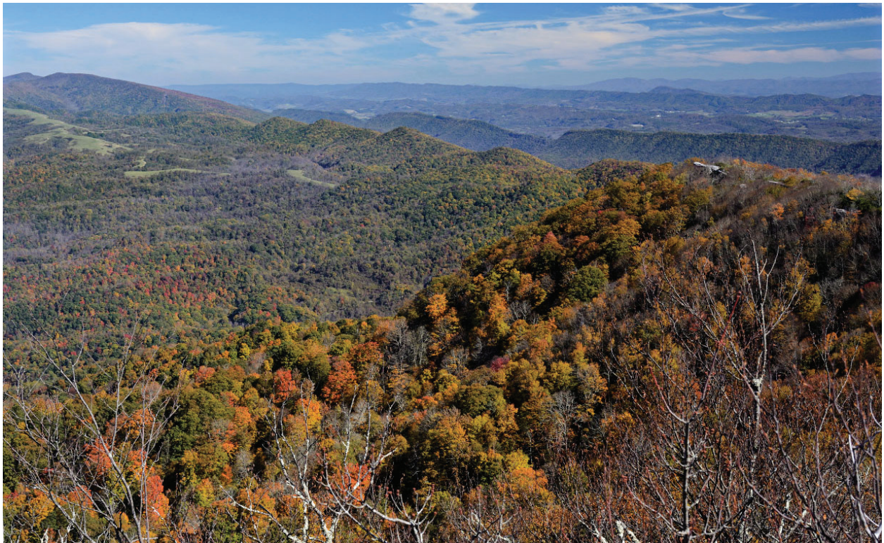
Summit view from Middle Knob at Channels Natural Area Preserve in Russell County.