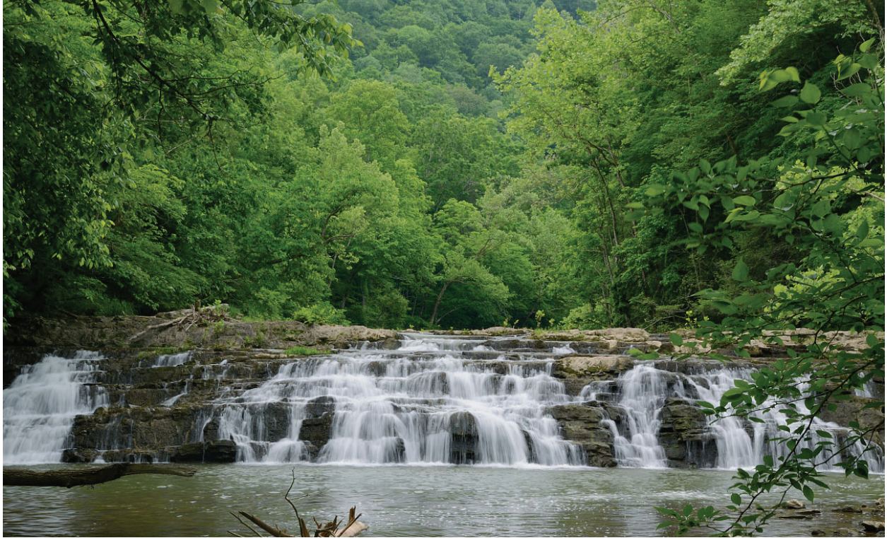
Big Falls on Big Cedar Creek at Pinnacle Natural Area Preserve in Russell County.