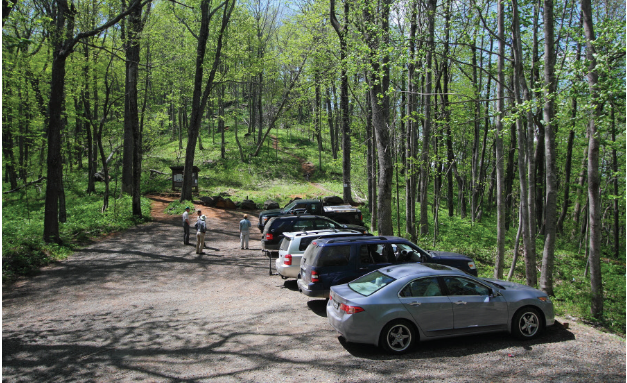
Buffalo Mountain Natural Area Preserve parking area, kiosk and trailhead.