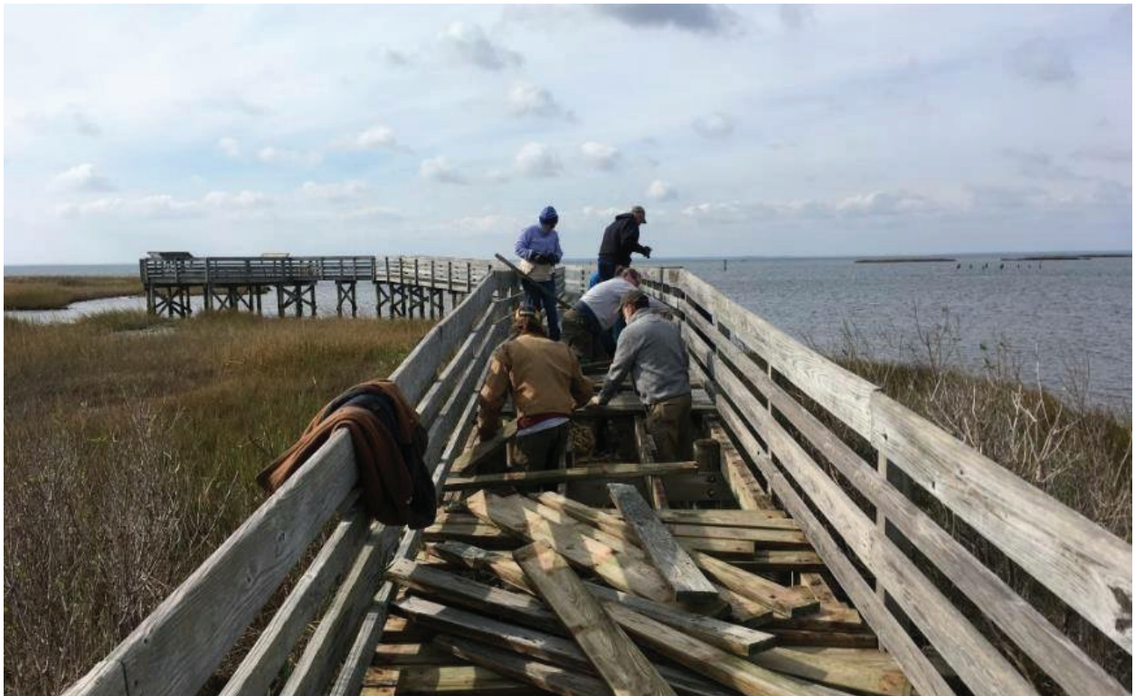
Local volunteers assist DCR stewards with repairs to the boardwalk at New Point Comfort Natural Area Preserve in Mathews County.