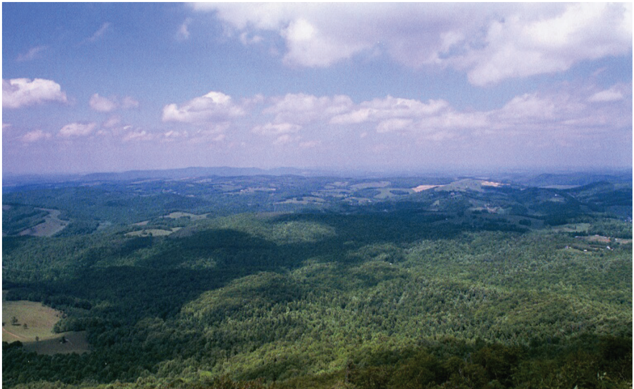
View from summit of Buffalo Mountain in Floyd County.