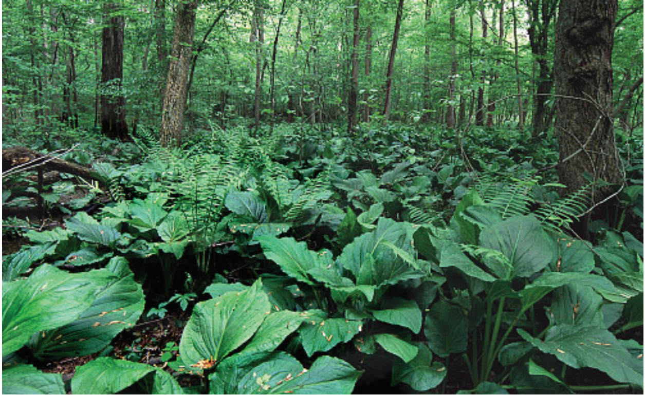
Cabin Swamp – a basic coastal plain seepage swamp at Hickory Hollow Natural Area Preserve.