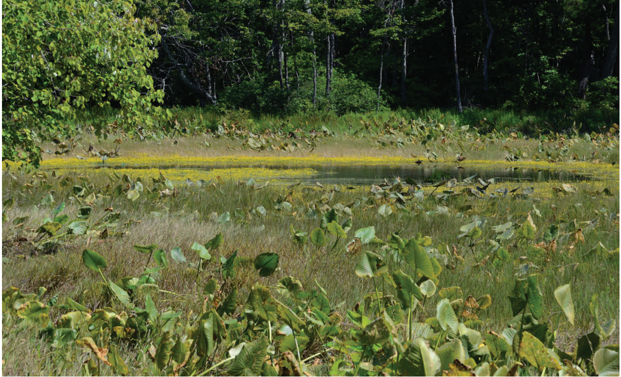
Shenandoah Valley Sinkhole Pond at Deep Run Ponds Natural Area Preserve.