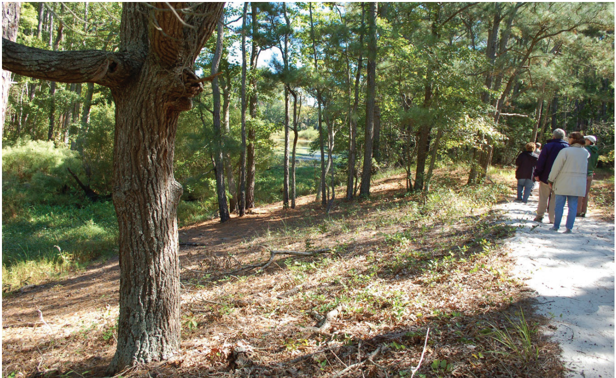
Hiking in the Maritime Dune Woodland at Savage Neck Dunes Natural Area Preserve.