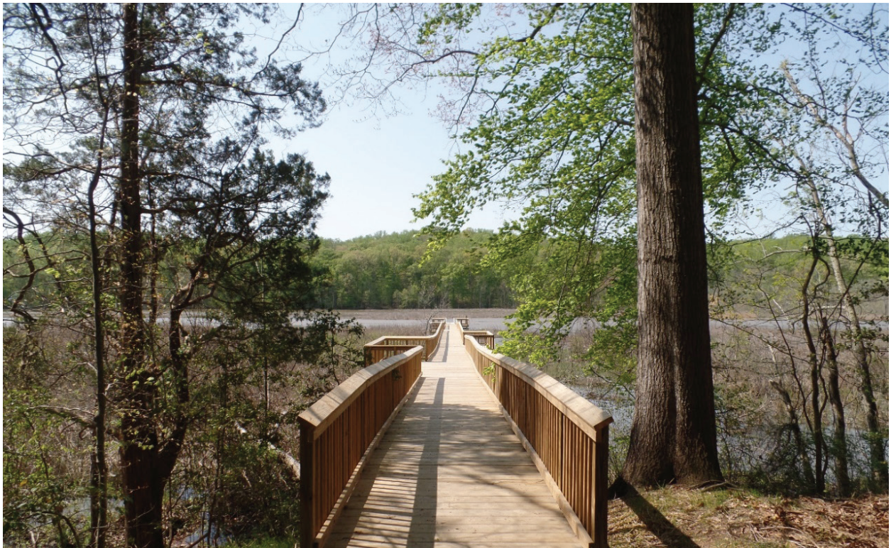
Accessible hand-carry boat launch at Crow's Nest Natural Area Preserve.