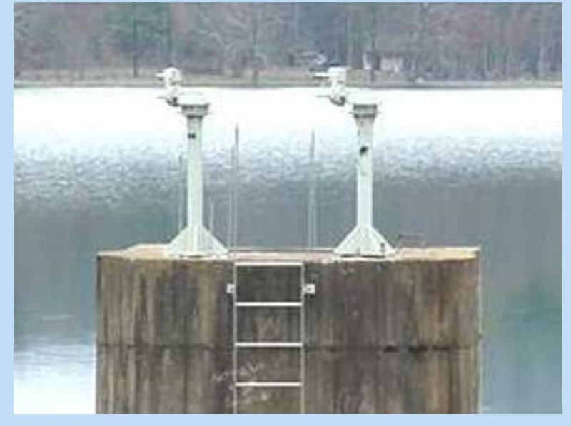
Typical Gate Operators 44