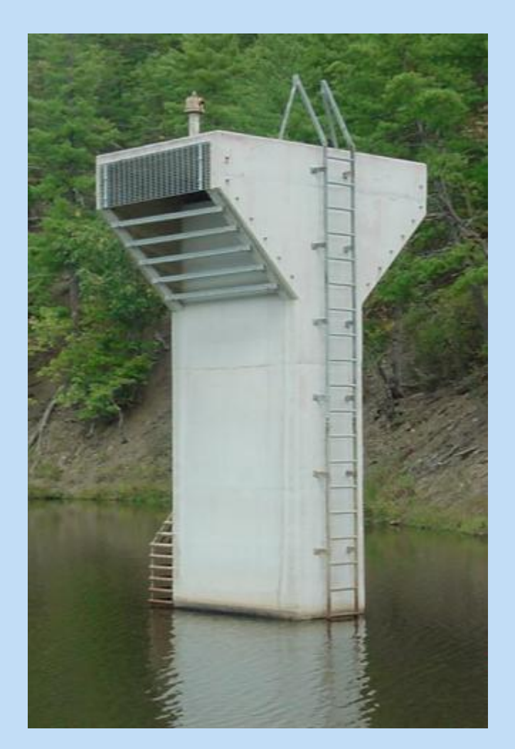
2 Stage Baffled Concrete Riser