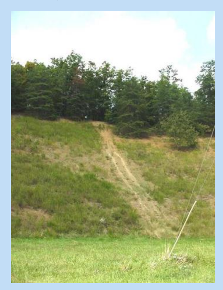
4 x 4 or ATV Damage