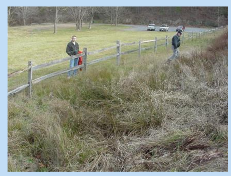
Seepage and/or Wet Spots on the Toe