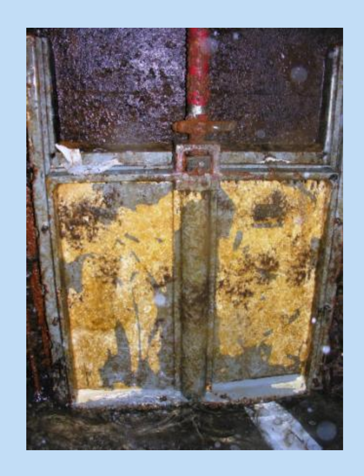
High Pressure Gate (Rodney Hunt)