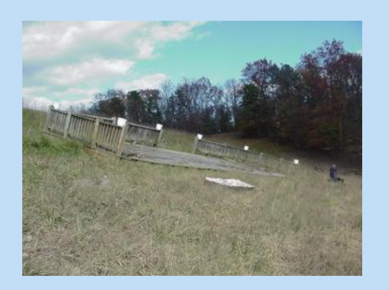
Decks, Docks Etc.