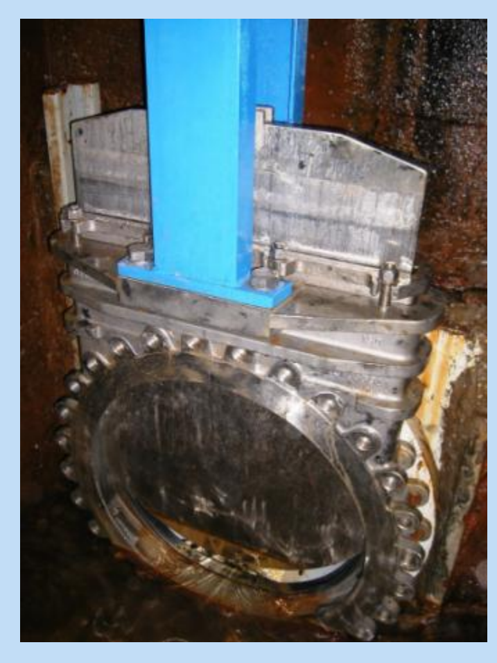
Hydraulically Activated Knife Gate