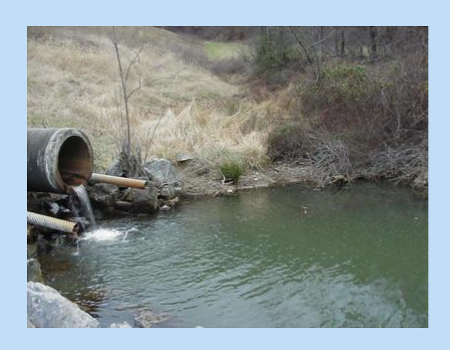
Rip Rap Missing Or Displaced