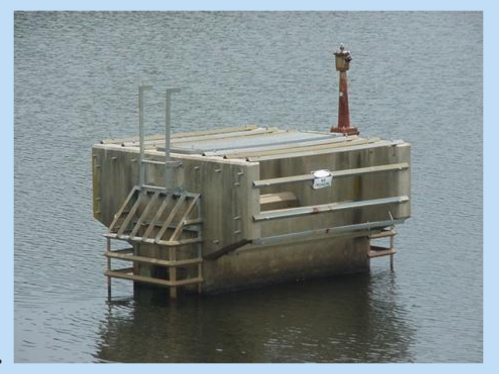
2 Stage Concrete Open Top Design