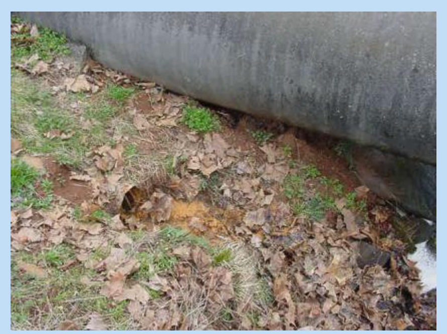
Toe Drain Blocked – Not flowing freely