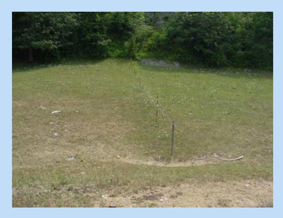
Fence at Control Section