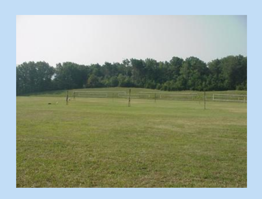
Obstructions in Spillway