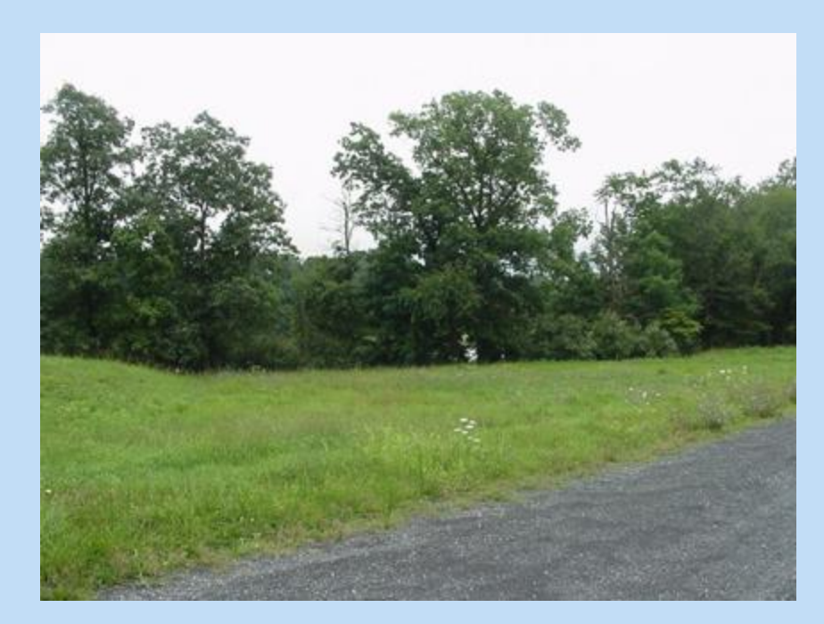
Entranced Blocked with Trees