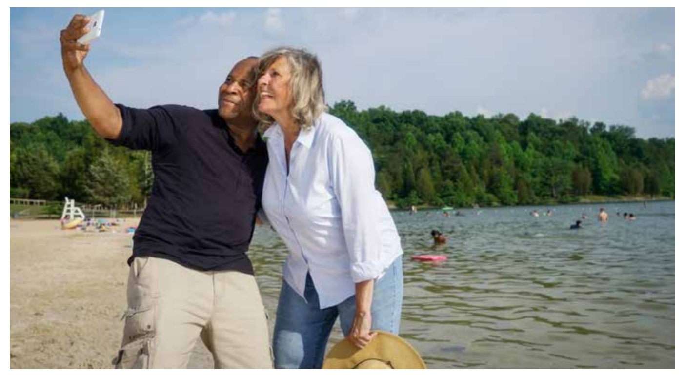
Enjoying friends at Lake Anna State Park