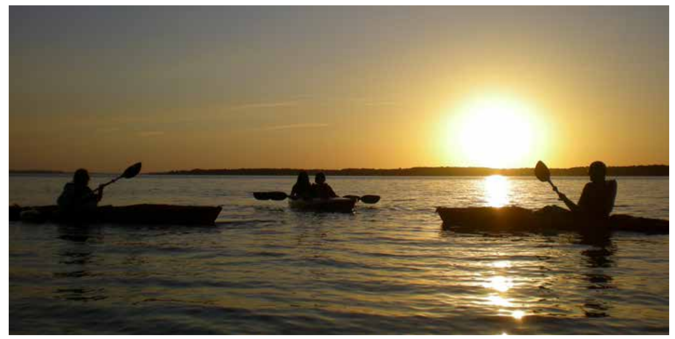
Kayaking on the Potomac