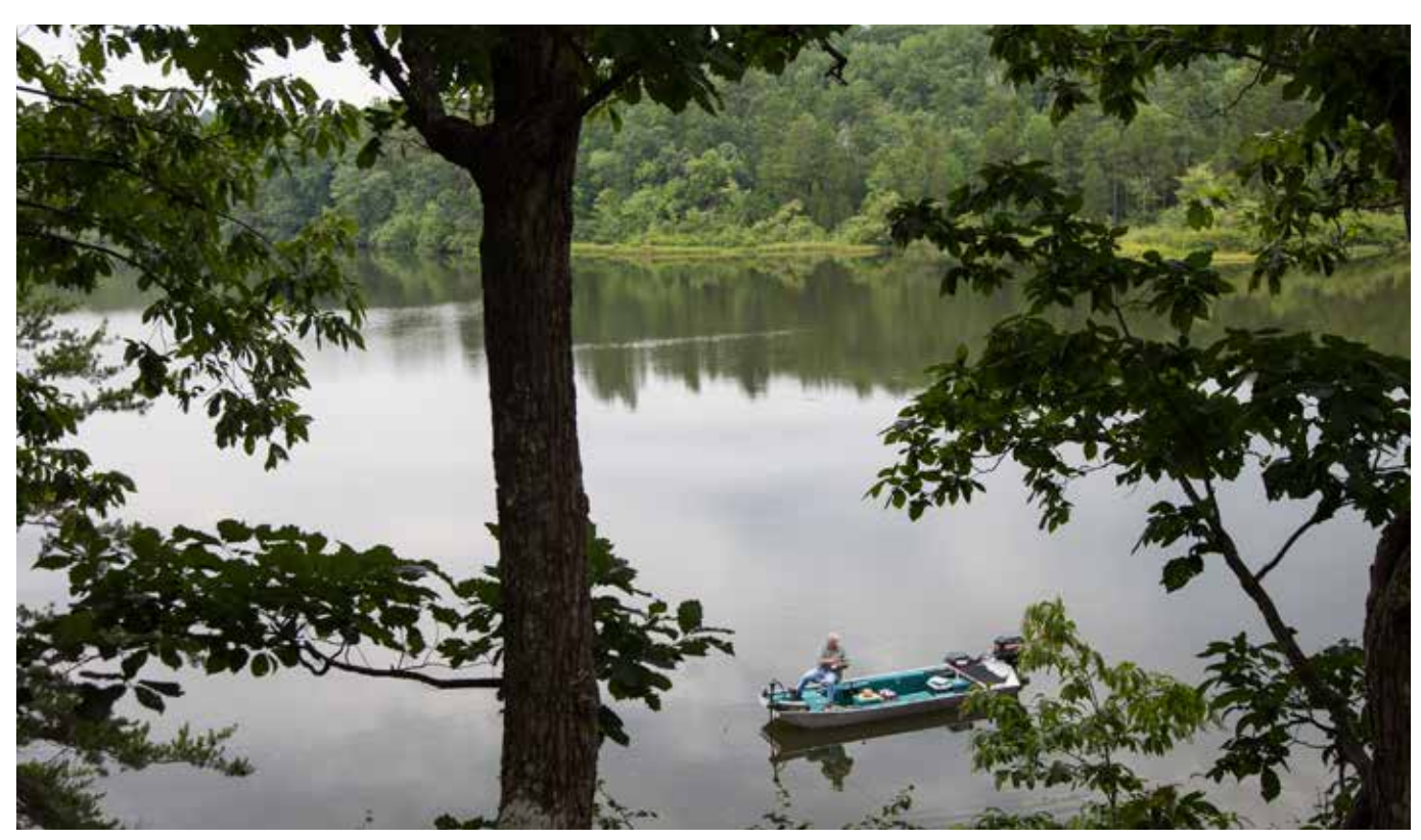
Fishing at Holliday Lake State Park | Virginia Department of Conservation and Recreation