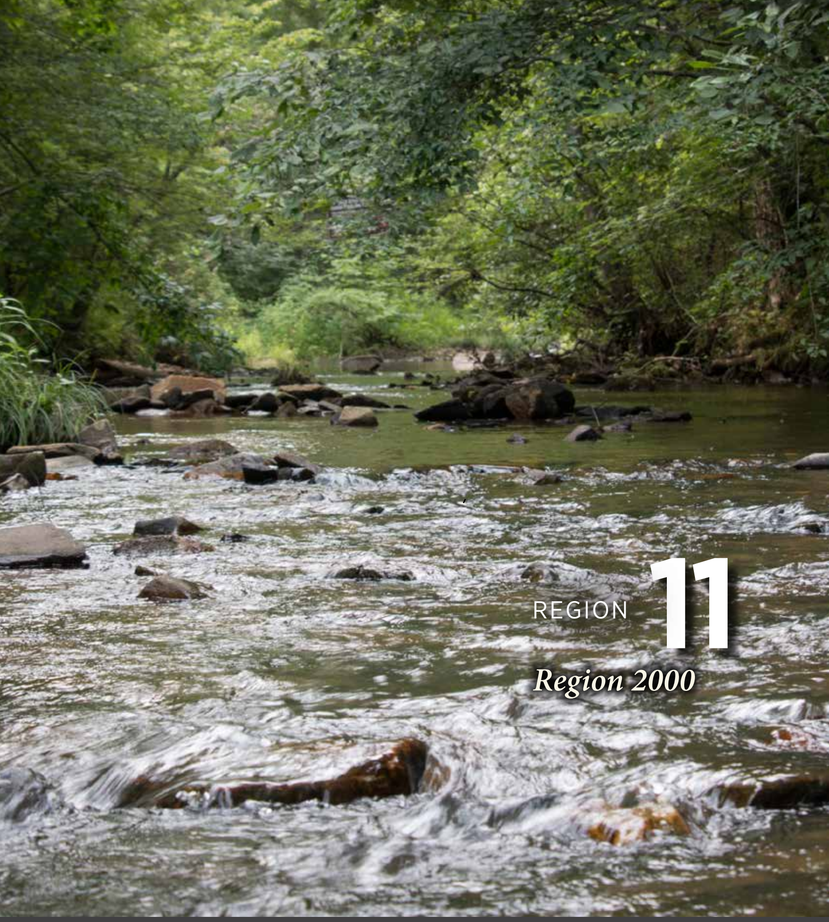
The Appomattox River | Virginia Department of Conservation and Recreation