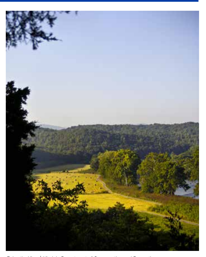
Enjoy the View | Virginia Department of Conservation and Recreation