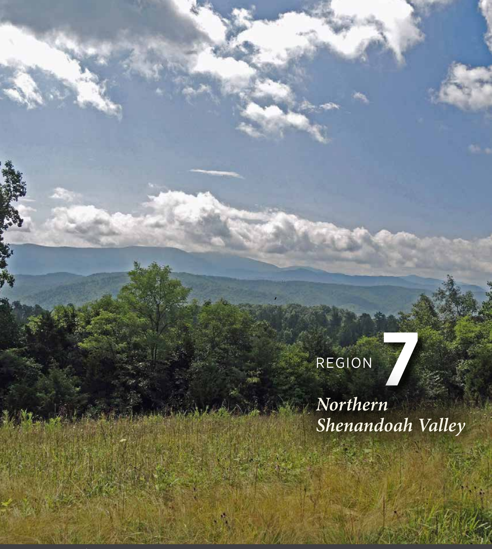
Seven Bends State Park | Virginia Department of Conservation and Recreation