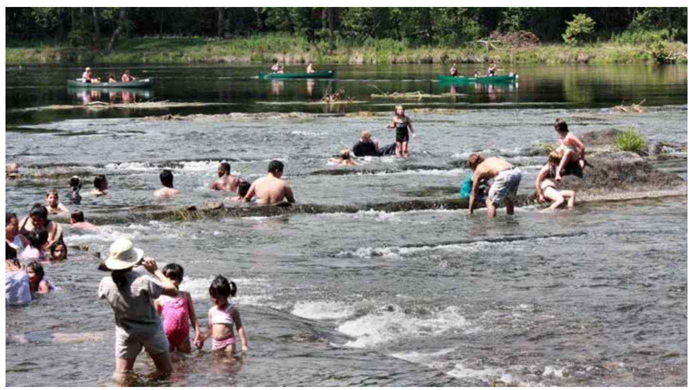
Everyone in the water! | Virginia Department of Conservation and Recreation