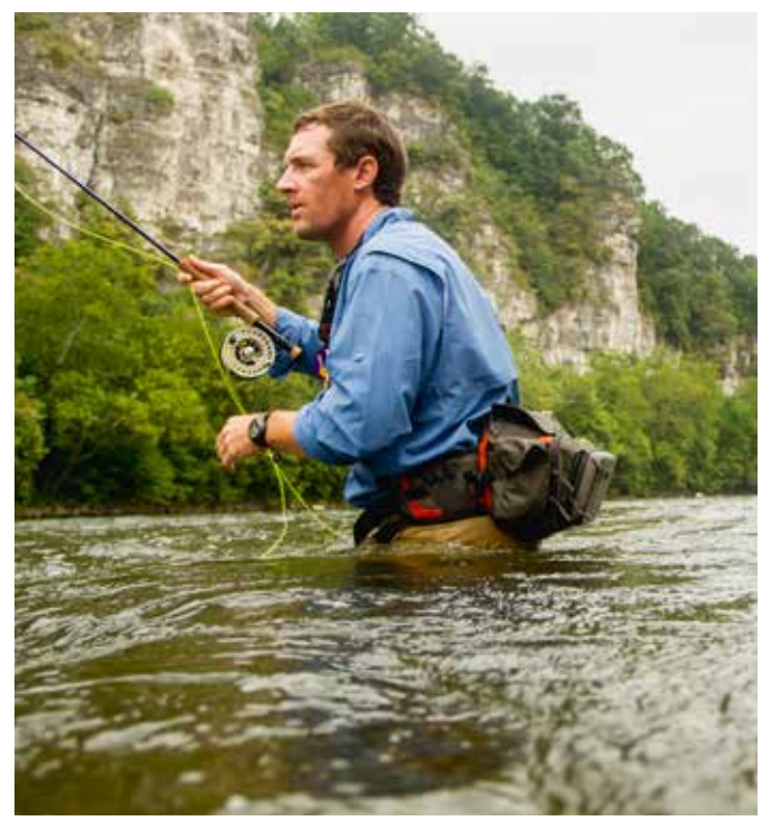
The New River in Giles County | Jeff Greenough

Information as of Feb. 28. 2018. Source: Virginia Natural Heritage Program