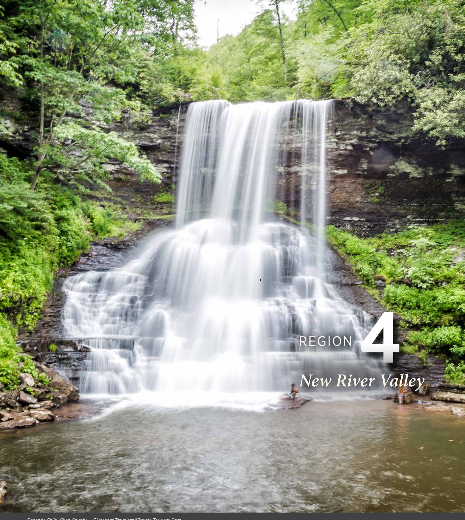
Cascade Falls, Giles County