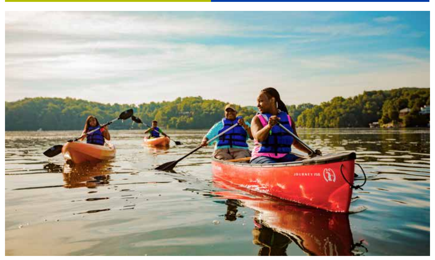
Claytor Lake State Park, Pulaski County