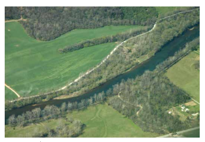
Riparian buffer | Virginia Department of Forestry

The amount of impervious surface in a watershed directly affects the amount of runoff, altering natural drainage patterns, eroding stream banks, increasing flooding and harming sensitive aquatic life with sediment and other pollutants. Not only does impervious surface accelerate stream erosion and degrade surface water quality, but it also greatly reduces recharge of groundwater supplies. The Center for Watershed Protection reports that streams in watersheds with as little as 10 percent impervious cover have significantly reduced water quality and the more impervious cover there is, the more impaired the streams.