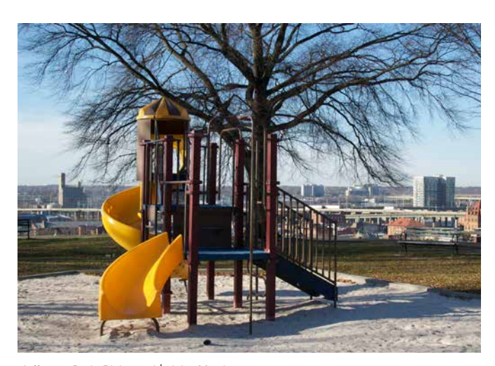
Jefferson Park, Richmond

A vibrant economy ensures the financial resources to maintain healthy ecological systems and environmental quality. Preserving land and natural resources is critical to a community's economic vitality. Natural open space and trails are prime attractions for potential homebuyers, increasing property values and thereby local tax revenues. More than 77 percent of potential homebuyers rated natural open space as "essential" or "very important," and walking and bicycling trails are among the list of attributes most desired by homebuyers. Open space, outdoor recreation and a clean, visually attractive environment draw and retain businesses and improve quality of life.