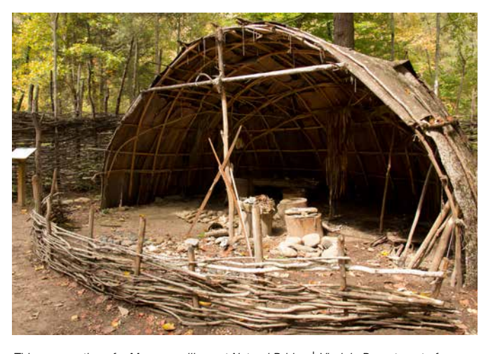
This a recreation of a Monacan village at Natural Bridge

Historic land protection can take a number of forms. One commonly recognized form is the protection of actual historic sites, such as battlefields, settlements, plantations and historic homes, many of which have retained their original characteristics. Other sites of historic value may be obscured, but not obliterated, by changes in the landscape. Archeological sites often fall into this category and need to be protected from further damage. Many natural landscapes across Virginia are of invaluable cultural significance to the American Indians who called Virginia home long before Europeans arrived.