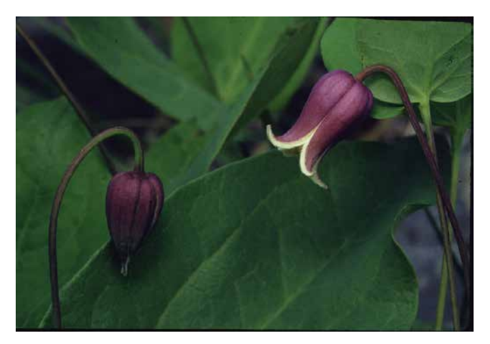
Addisonís Leatherflower | Hal Horwitz

Protecting habitat for aquatic species is a significant challenge because much relies on protecting watersheds encompassing large land areas. Carefully focused watershed protection efforts will help secure the future for many rare aquatic species concentrated in specific river systems, such as the Clinch River in southwest Virginia. Efforts to protect riparian zones on farms