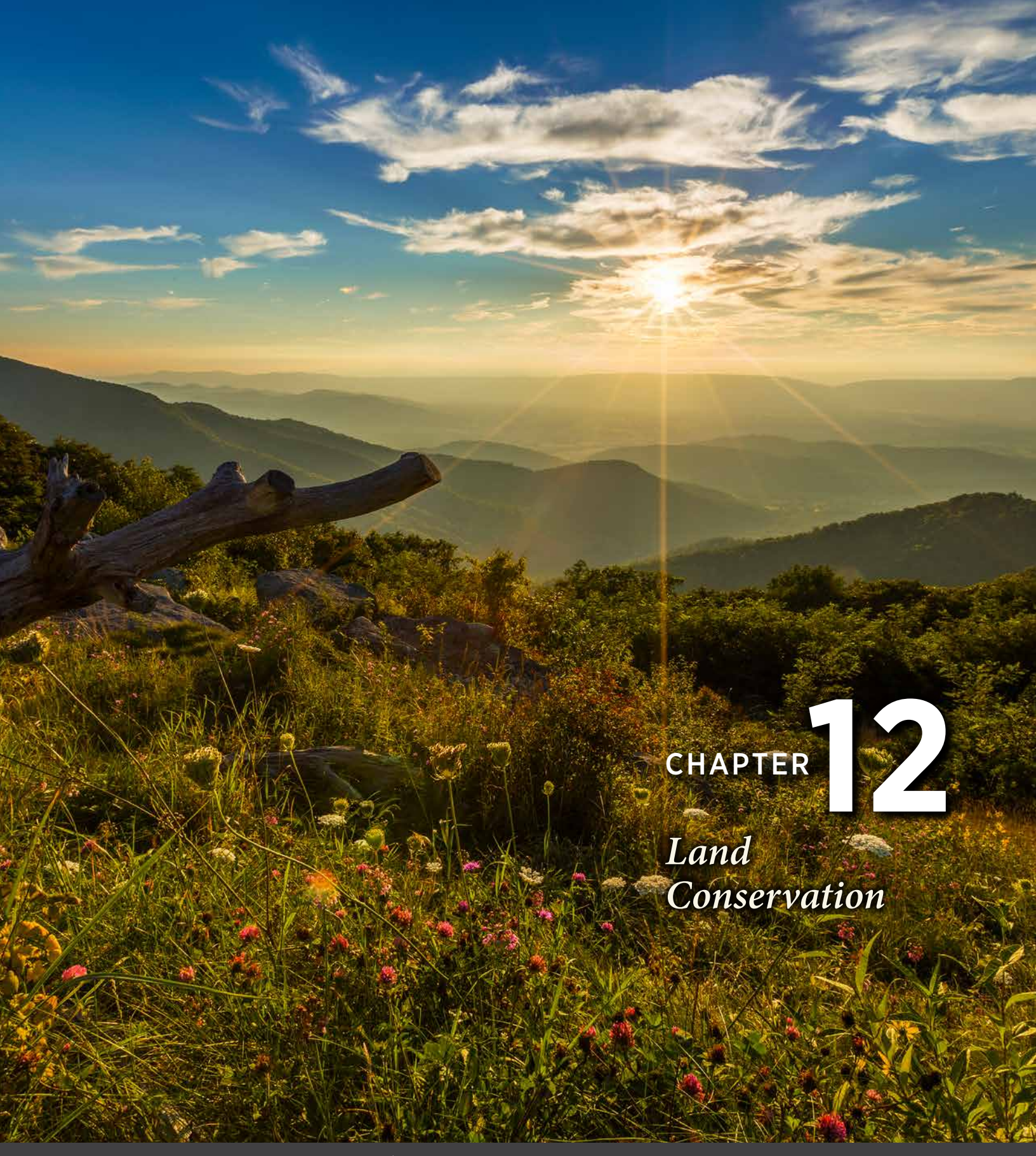
Timber Hollow Overlook off Skyline Drive, Shenandoah National Park