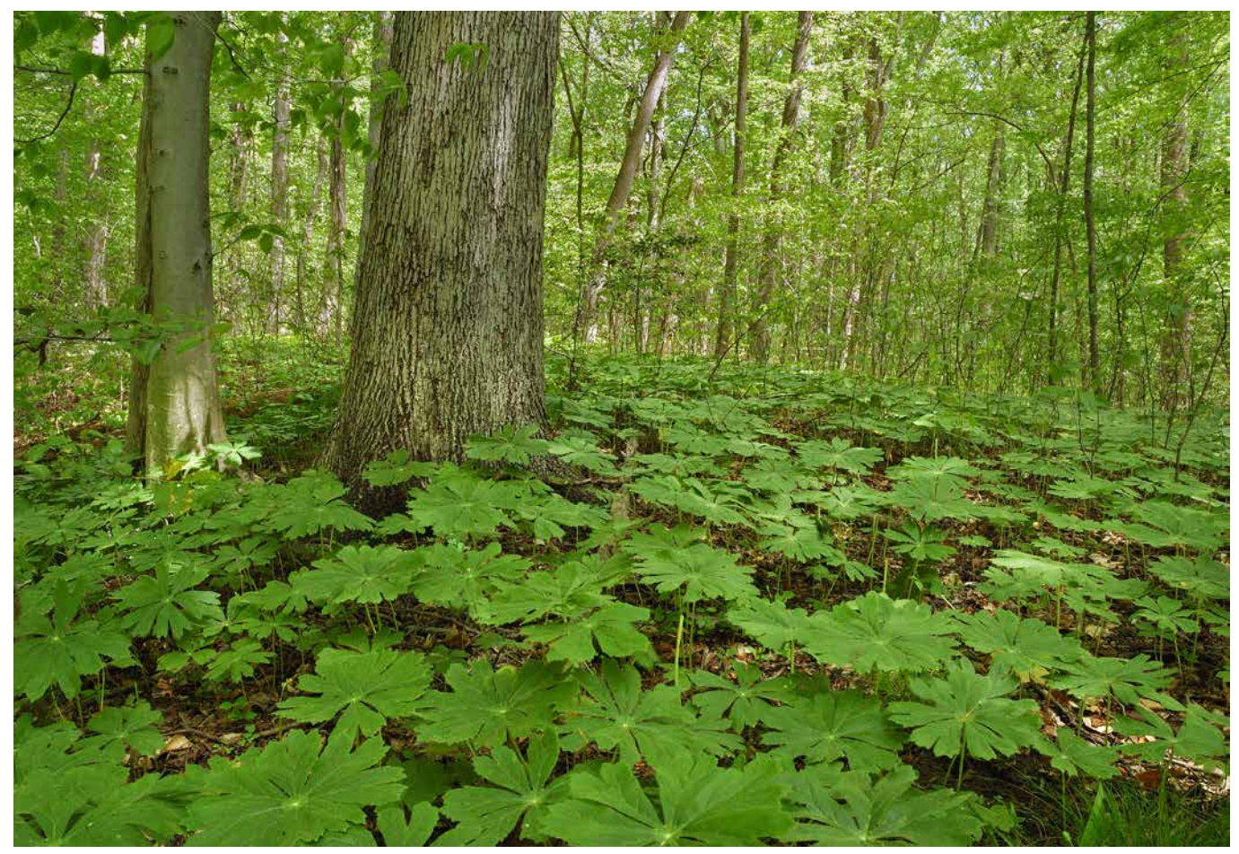
Crow's Nest Natural Area Preserve

Most of the popular forms of outdoor recreation — hiking, water access, visiting natural areas and parks — are either dependent on resource lands and waters or are enhanced by their proximity to them. Land protection is essential for ensuring outdoor recreation opportunities for Virginia's growing population. If the citizens of the Commonwealth are not afforded opportunities to enjoy the outdoors and experience Virginia's diversity, the future of Virginia's outdoors will be jeopardized. Long-term support for land conservation and open-space protection is strongly tied to outdoor recreation experiences for children and adults. Both public and private lands are important for meeting the needs of outdoor recreation. Public recreation areas are increasingly in demand as large tracts of private land are subdivided and traditional local recreational uses are lost. Conserved private land is important, not only in providing much of the hunting opportunities east of the Blue Ridge, but also in maintaining scenic vistas and serving as buffer lands around major parks and natural areas.