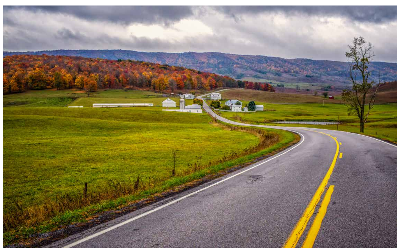
Route 250, Highland County