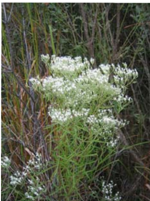
Boneset Eupatorium hyssopifolium