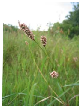
Smartweed or Knotweed - Polygonum spp?