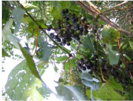
Grapes— Vitis spp? (Muscadine is my guess— Vitis rotundifolia )