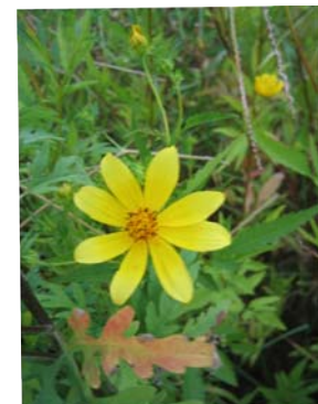
Tickseed sunflower Bidens coronata