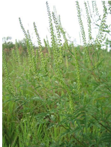
Rag weed Ambrosia artemesifolia