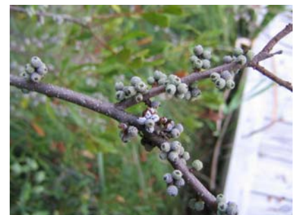
Wax myrtle berries Morella cerifera