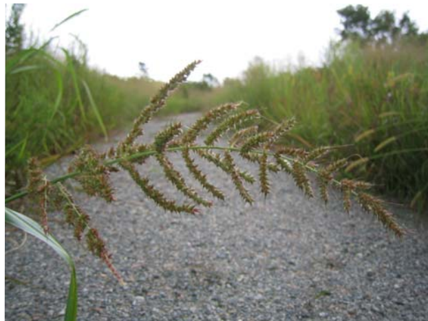
Barnyard Grass— Echinochloa spp?