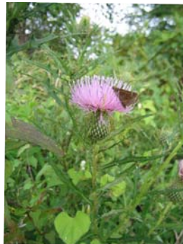
Thistle— Cirsium spp? non-native and invasive but sometimes attract butterflies