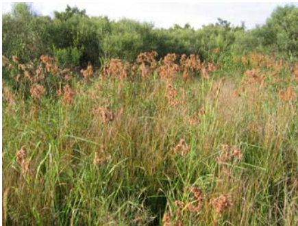
Wool Grass— Scirpus cyperinus

The very large leaved plant near the parking lot is a Royal Paulownia, a native of the Far East. At maturity, they have clusters of hanging wisteria-looking blooms in the spring. ( Preserve stewards are attempting to eradicate these invasive alien trees ) The seed pods of this plant were once used as packing material for fine porcelain from the orient, like Styrofoam peanuts today, and as a result have colonized all over the U.S. The wood is highly valued in Japan for dowry chests, and mature specimens of Paulownias have actually been cut down and stolen by Paulownia rustlers! Some other plants you may see in the parking lot are pictured below. Look for the chat in the tree... (also Lance Johnson saw a cuckoo there this summer!)