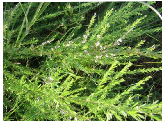
Sericea lespedeza Lespedeza cuneata