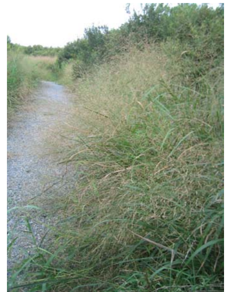
Switchgrass - Panicum virgatum