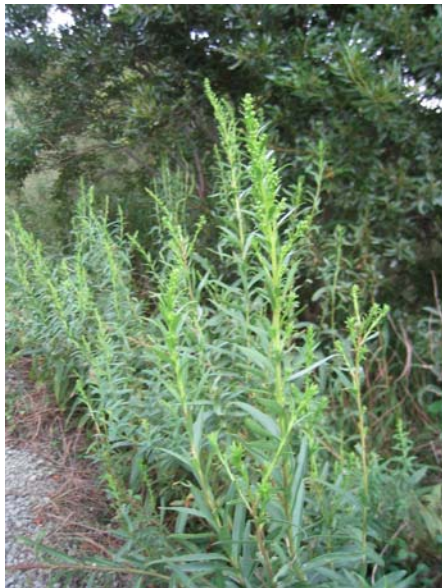
Sea side goldenrod Solidago sempervirens