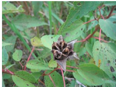
Marsh mallow Hibiscus moscheutos