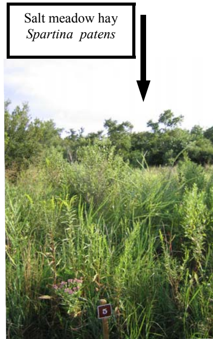
Salt meadow hay Spartina patens