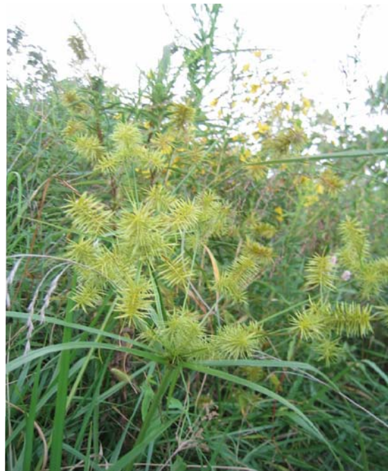
A nut sedge Cyperus spp?