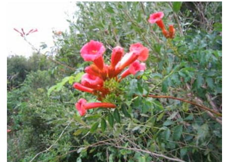
Trumpet creeper— Campsis radicans