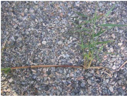
Rhizome of common reed— Phragmites australis