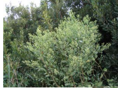
High tide bush Baccharis halimifolia