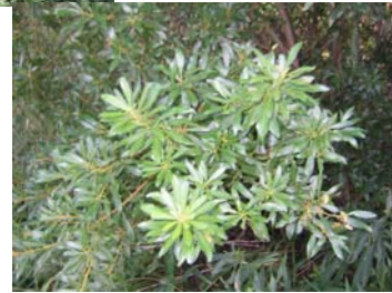
Wax myrtle Morella cerifera