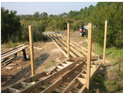
Boardwalk construction October 2002