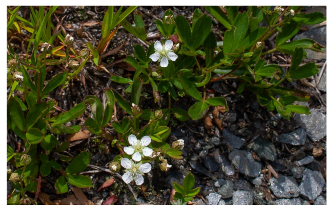
Three-toothed cinquefoil (Sibbaldia tridentata)

Buffalo Mountain was protected with the support of The Nature Conservancy, Floyd County, and the 1992 Virginia Parks and Natural Areas Bond.