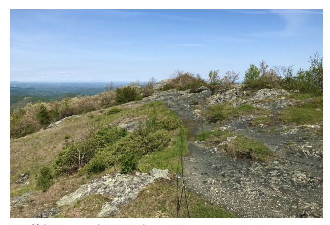
Buffalo Mountain summit