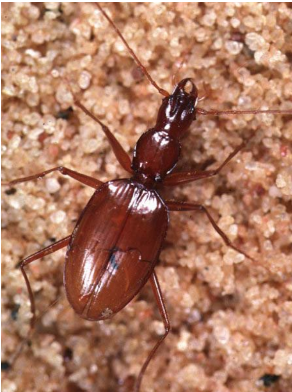
This half centimeter long cave beetle is one of dozens of cave beetle species found in the eastern United States.

In a small cave in Tazewell County, amber colored beetles a few millimeters long scurry back and forth across mudbanks along a small stream. Eyeless and diminished in pigment (see picture), their other heightened senses allow them to navigate the lightless cave environment in search of food, water, shelter, and mates. The Maiden Spring Cave Beetle ( Pseudanophthalmus virginicus ) is known from this single cave and nowhere else. Even more amazingly, this species is not unique in its isolation. Of the more than 39 cave beetle species documented in Virginia, 23 are known from five or fewer locations globally, with an additional seven species known from 20 or fewer locations. Each species is confined to a single cave or small group of nearby caves which may be connected by beetle-sized passages through which human cavers won't fit.