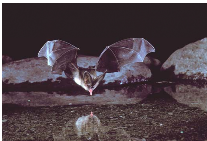
A Virginia Big-eared Bat Drinks on the Fly.

Both male and female Virginia Big-eared Bats typically congregate in large groups for hibernation, but in summer females separate to form maternity colonies whereas males are usually solitary. Females typically give birth to one pup during June. The young pup grows rapidly and can be on the wing in as few as three weeks. They are typically weaned, nearly full grown, and feeding on their own at about seven to eight weeks. Several studies have shown that this bat feeds primarily on moths but may occasionally take other insects such as beetles, flies, and ants during its nocturnal wanderings.