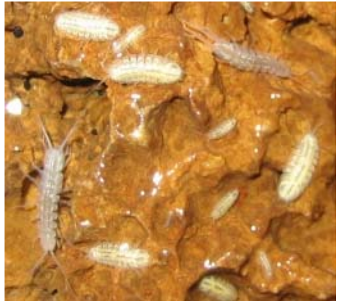
Two cave isopod species coexist in this Lee County Cave stream: Caecidotea recurvata (elongated) and Lirceus usdagalun , a smaller pill-shaped isopod known only from central Lee County and protected under the Endangered Species Act.

to Virginia's list of protected species, are particularly vulnerable because of their limited geographic range and are sometimes listed because of proximity to development corridors or expanding urban areas.