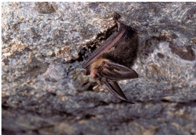
A Virginia Big-eared Bat Hangs Out on the Cave Wall.

The Virginia Big-eared Bat ( Corynorhinus townsendii virginianus ) may not win any beauty contests, but it is one of the most unique and endangered bat species in North America. It also happens to be the official State Bat of Virginia as designated by a recent legislative gesture by state lawmakers and Governor Mark Warner. Texas is the only other state in the country with a bat designated as an official representative; the Mexican Free-tailed Bat ( Tadarida brasiliensis ) is the "state flying mammal" of Texas. Oddly enough, this species is rumored to have shown up once or twice in Virginia, blown to the north by powerful hurricane winds.