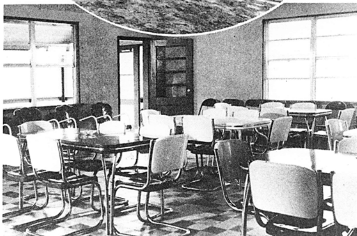
Modern housekeeping cabins (oval) are fully equipped and furnished. A restaurant serves meals in dining room indoor and on porch.

The park is situated in the heart of Prince Edward State Forest, and the large lake, with its white sand beach surrounded by the dark green of the forest, creates a scene of peaceful beauty and quiet. Six cabins, completely equipped for housekeeping, overlook the lake. A modern bathhouse, sandy beach, diving tower, parking area, and the picnic ground with its tables, ovens and shelter, provide comfortable facilities for large and small groups. There is a restaurant, and also a small store from which supplies may be purchased. The thirty-acre lake is well stocked with bass, crappie and bream, and boats are for hire.