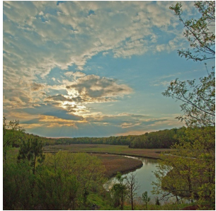
The view from the Taskinas Creek Overlook

Taskinas Creek Overlook ---Just left of the Visitor