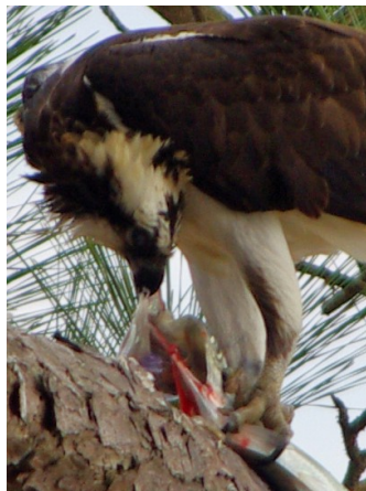
An Osprey enjoys a meal along the Bluebird Loop Trail

Woodstock Pond Trail Head ---From the trail head sign follow the hard gravel path to the 7-acre Woodstock Pond for fresh water fishing and wildlife watching. From the spillway, there is a commanding view of the river as well as the pond. Continue on to further hiking adventures as Woodstock Pond leads to the Mattaponi, Beaver, and Backbone Trails. Or, take the stairwell to the river access to enjoy the river bank. Shelter #3 is nearby with great views of the river as well. Be sure to stop by the trail kiosk to see all of the unique places to explore.