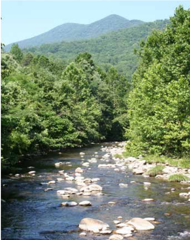
Nelson County stream