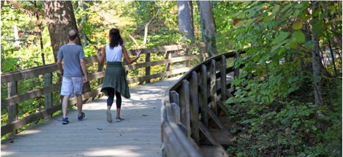
Saunders Monticello boardwalk trail