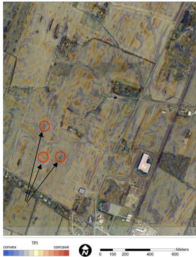
Figure 2. Topographic Position Index (TPI) showing local topographic concavity and convexity derived from a 1m LIDAR elevation model and overlain on aerial imagery.

Two-foot contour map of a project site, showing a series of closed depressions (sinkhole) in lineaments.