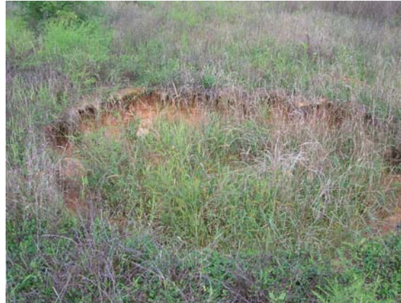
Figure 4A. Actively forming cover collapse sinkhole in granular sediments.

The investigator should be aware of any area where there are signs that water is actively infiltrating into the surface, as this may be an indicator of a subsurface conduit that is soil-filled but receiving drainage (see Figure 6). In this regard, distinct changes in vegetation can be a clue if topographic is slight or absent. These areas should be carefully noted and investigated if they are to be impacted by proposed site development, as they can be the site of sudden and catastrophic subsidence if not managed properly.