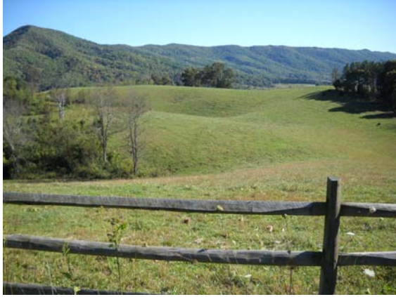
Figure 4C. Mature, stable sinkholes in cohesive soils.