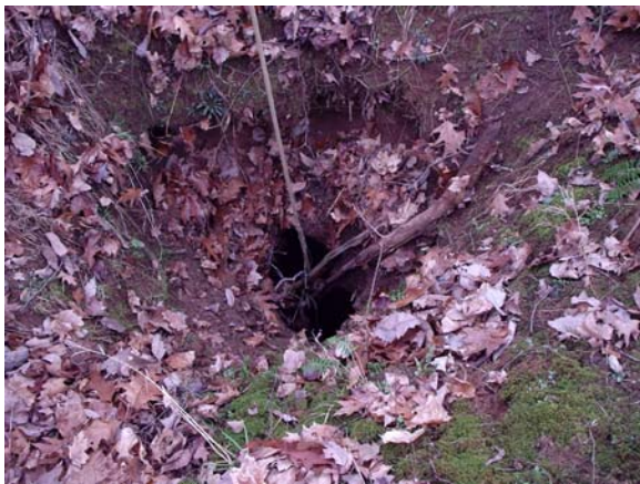
Figure 4E. Soil-bottomed sinkhole with open "throat". A 40' deep vertical cave lies

below the opening. This type of structure is sometimes called a "natural trap".