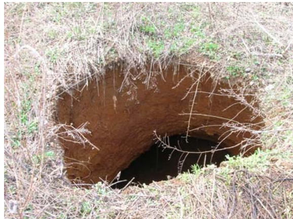
Figure 4B. Actively forming cover collapse sinkhole in cohesive, fine-grained sediments.