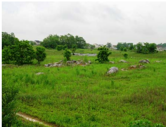
Figure 10. Exposed bedrock pinnacles located in the base of a stormwater detention structure in West Virginia.

Finally, areas of a site designated for storm water management BMPs, especially extended detention and/or retention ponds or impoundments, must be carefully examined for the presence of pinnacled bedrock.