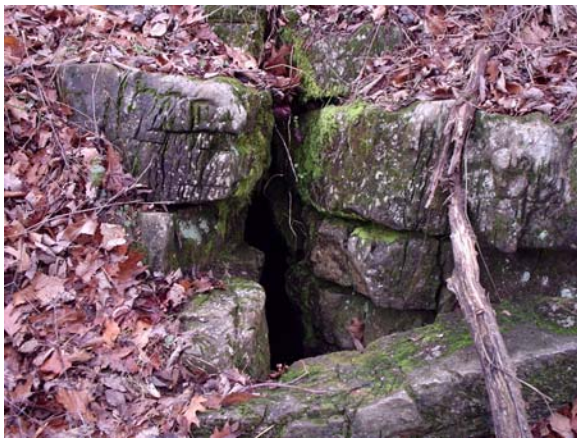
Figure 4D. Mature, rock-walled sinkhole with open "throat" (i.e. cave entrance).