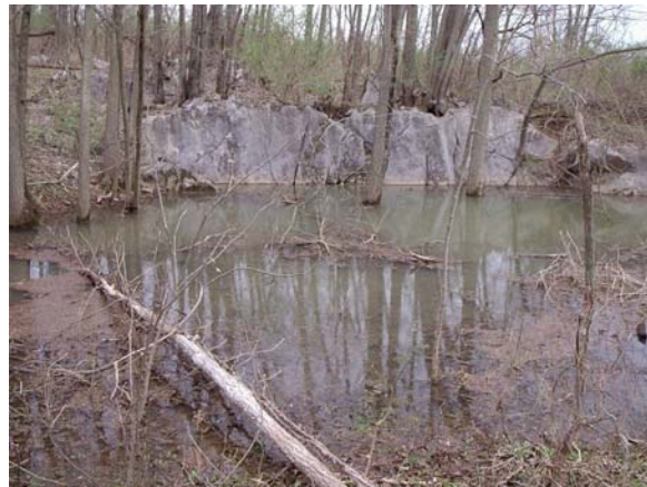
Figure 5B. The same structure as shown in Figure 5A during groundwater high stand conditions. When this photograph was taken the estavelle was an active, ephemeral spring with an outflow measured at 60 gpm.