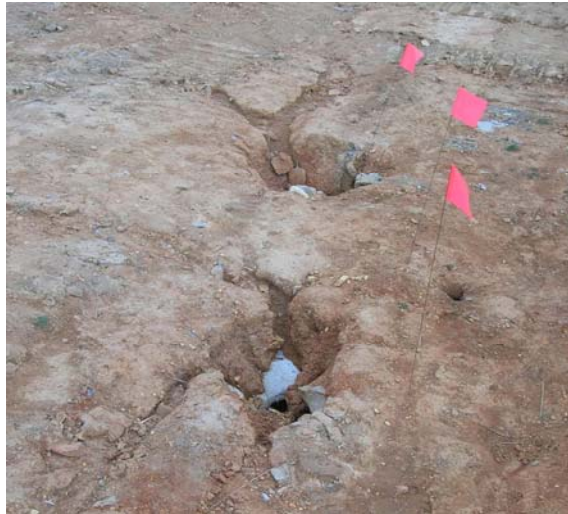
Figure 7. A pair of cover collapse sinkholes that opened at a site under development after the vegetation and topsoil was stripped. Open throat, air-filled conduits in the bedrock were located at the bottoms of both of these features.

Nevertheless, the identification of covered karst is often dependent upon the investigator's knowledge of regional geology, soils, and prior experience with sites in similar geological settings.