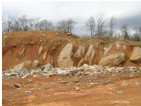
Figure 8. Excavated site cross-section showing pinnacled bedrock with intervening soil-filled "cutters".

In areas where the bedrock is steeply inclined, differential solution activity can produce a "pinnacled" bedrock surface, often with exposed bedrock ledges and deep intervening "cutters" in between containing residual soil (Figure 8).