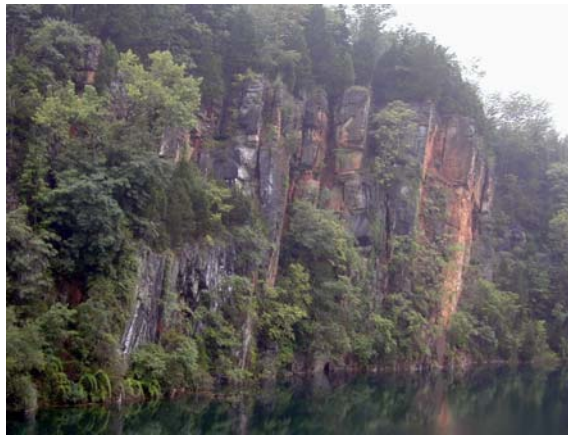
Figure 9. The epikarst exposed in an abandoned limestone quarry wall, showing steeply-angled open solution-modified fractures extending down to the quarry lake. The lake is representative of the local phreatic base-level, and demonstrates how contaminants and surface water can readily migrate to the underlying water table.

condition informally referred to as “sinkhole weather” which is characterized by extended dry weather or drought punctuated by periods of heavy rain. Sinkholes will often form when these conditions are present.