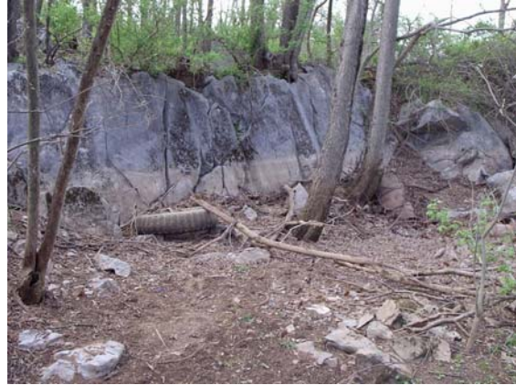
Figure 5A. An estavelle in groundwater low-stand conditions. Note the tell-tale water mark along the rock wall of the structure.

below the opening. This type of structure is sometimes called a "natural trap".